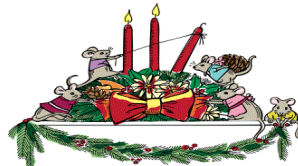
Deck the Halls

Join us on Saturday, December 3 at 10:00 a.m. as we gather to decorate the sanctuary for the Christmas season. The fellowship is great AND we have fun, too! Plus, many hands make light work!